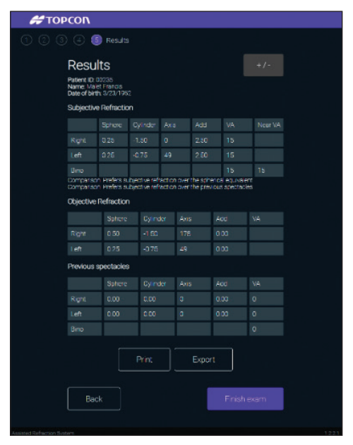
Figure 3. Chronos generates a succinct summary of each patient's examination findings after standard or semi-automated modes are used.

Proactive clinicians may find that the Chronos optimizes the workflow of their clinic. Patients are less likely to be