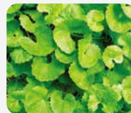
Centella Asiatica TECA