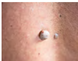
Skin tag / Acrochordon

With CryoPen sufficient power is available since liquified nitrous oxide freezes at a temperature of -89^{\circ}\text{C} . The application is accurate to the millimeter..